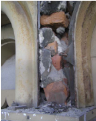
Load bearing piers.

West side arches do not include decorative exterior dental pieces, and the columns are simpler.