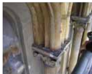
Some decorative arches are not connected to plates below.