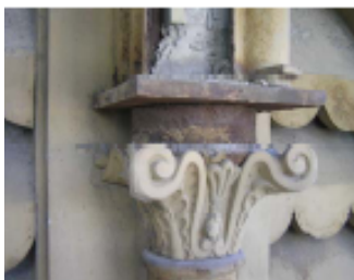
Column and arch system may be unstable.

In several places the column base appears to have lifted from the stone base.