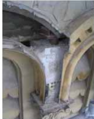
Load bearing arch.