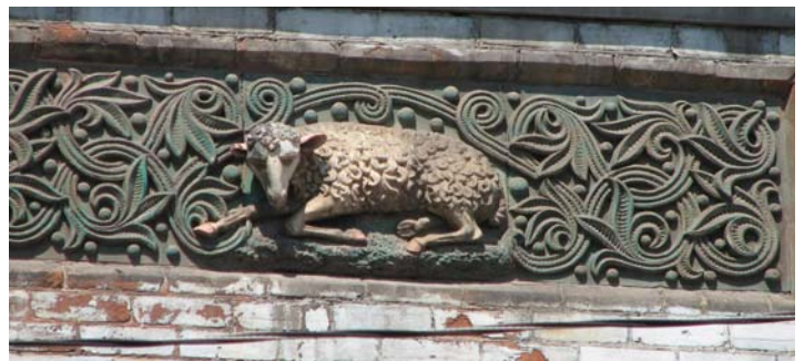
Tend my Lambs: found on the front of an old apartment building at Queen St. E. and Sherbourne St.