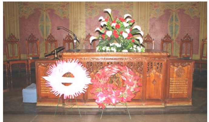
Church School and Memorial Wreaths.