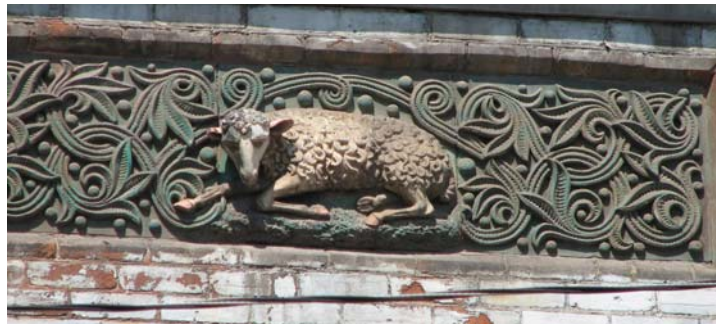
Tend my Lambs: found on the front of an old apartment building at Queen St. E. and Sherbourne St.